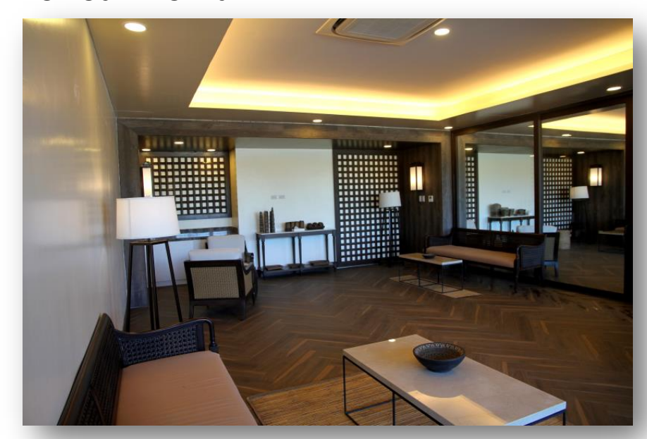
Lio Airport Terminal – ENR Lounge