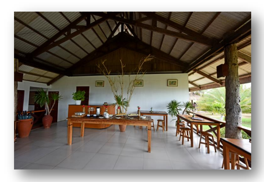
Sala de Apulit – Taytay, Palawan