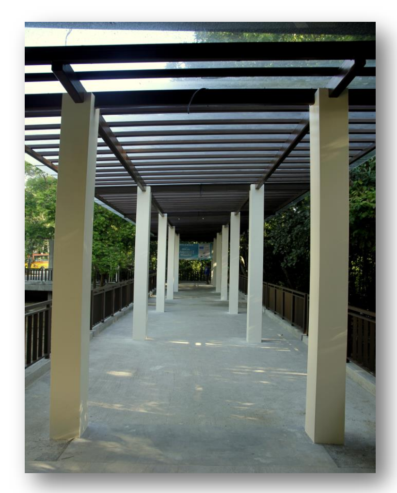
Lio Airport Terminal – Entrance/ Exit