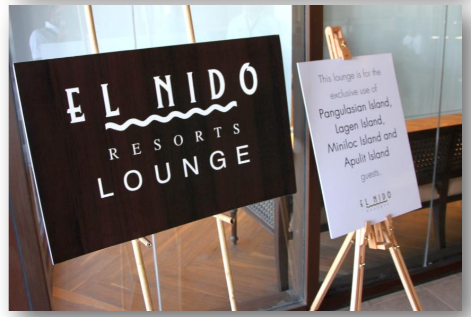
Lio Airport Terminal – ENR Lounge