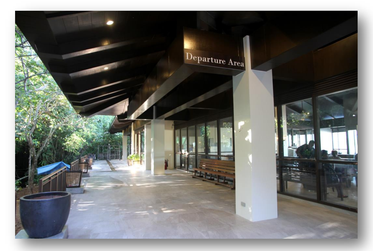
Lio Airport Terminal – Departure Outdoor Area

1. Guests take the scheduled boat transfers from the resort to Lio Jetty Port and are taken by the Club Car from the end of the Jetty Port, straight to Lio Airport Terminal.