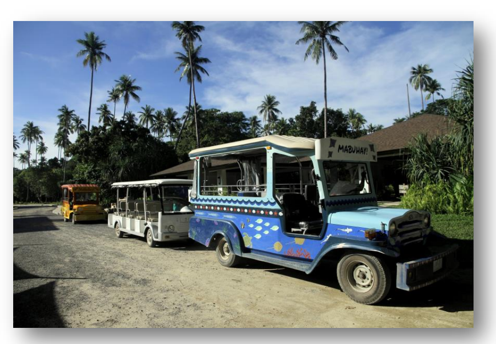
Lio Tourism Estate/ENR Club Car