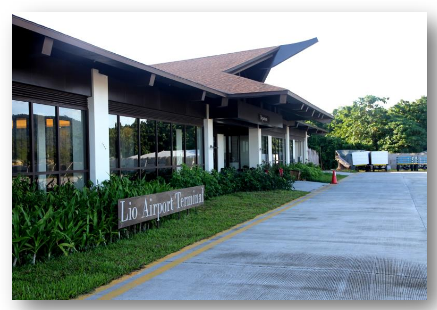
Lio Airport Terminal – Facade