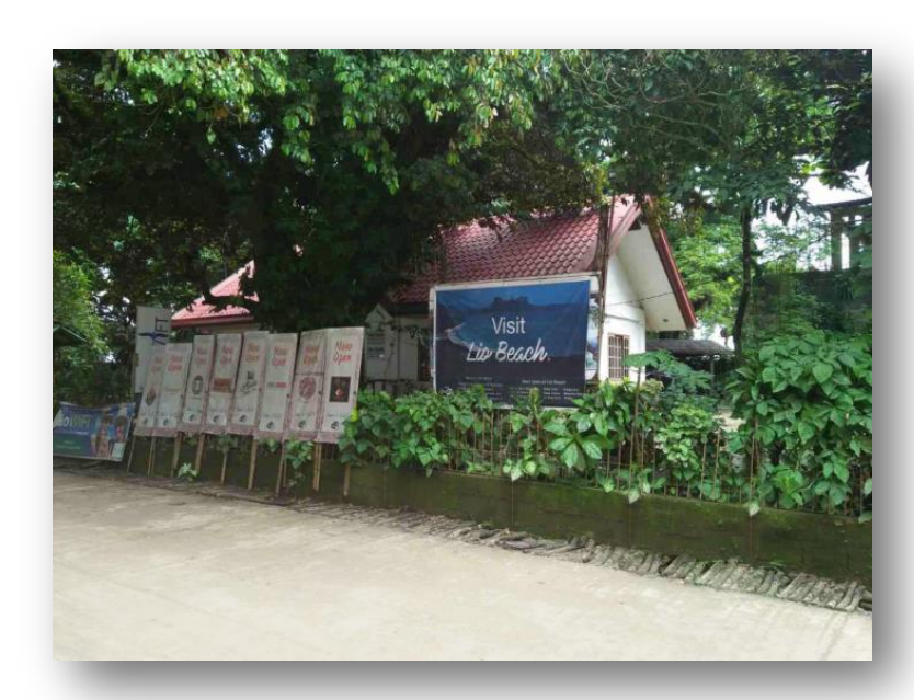
El Nido Resorts' Central Office

Van Transfer Schedule from El Nido Resorts Central Office to Taytay Port is between 7:30 - 8:00AM and 12:00 – 12:30 PM and joining guests will be charged Php 500 (per person, per way) to be settled at the resort upon check-out. Guests must be at the pick-up location at least 1 hour before the estimated time of departure.