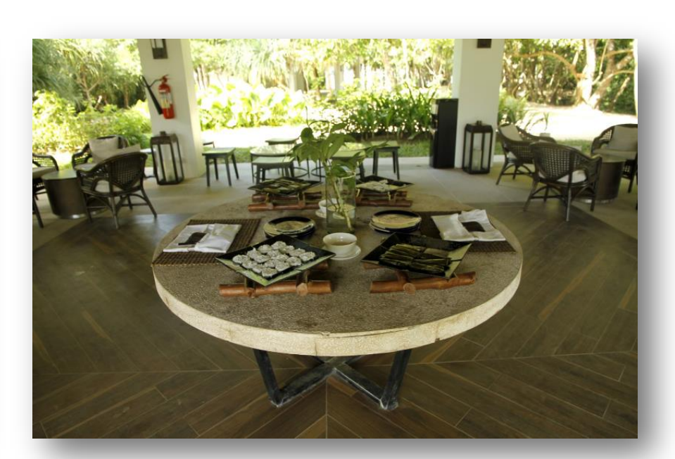
El Nido Resorts Jetty Lounge

6. Guests are taken by the Club Car to the end of the Jetty Port, for jump-off to the resorts.