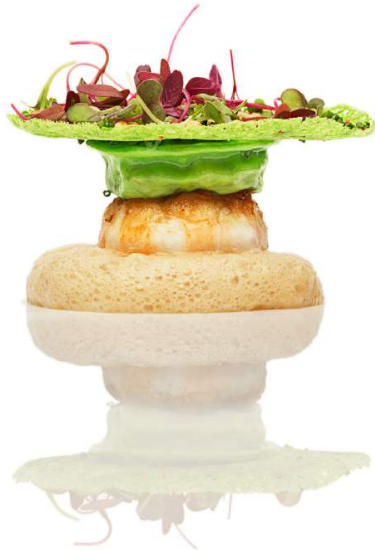
North Sea Langoustine with smoked leek and goose Ossiano